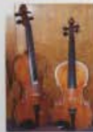
Chatfield Violin & Viola